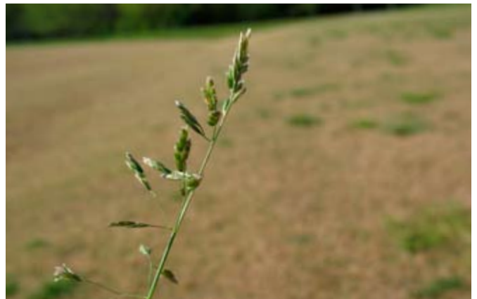
Figure 4. Annual bluegrass ( Poa annua ) seedhead

field with a cool-season turfgrass species (unless otherwise stated on the label).