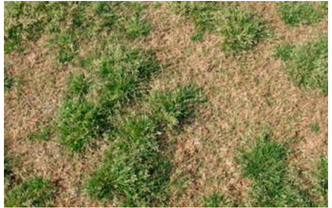
Figure 2. Annual bluegrass ( Poa annua )

Numerous preemergence herbicides are available for annual bluegrass control (Table 1). In Tennessee, annual bluegrass generally begins to germinate in early September. Keep in mind that preemergence herbicides act by preventing germinating seedlings from developing into mature plants. These herbicides must be applied prior to seed germination. For preemergence control of annual bluegrass, target applications for late August. Preemergence herbicides should not be applied if there is any consideration of overseeding the