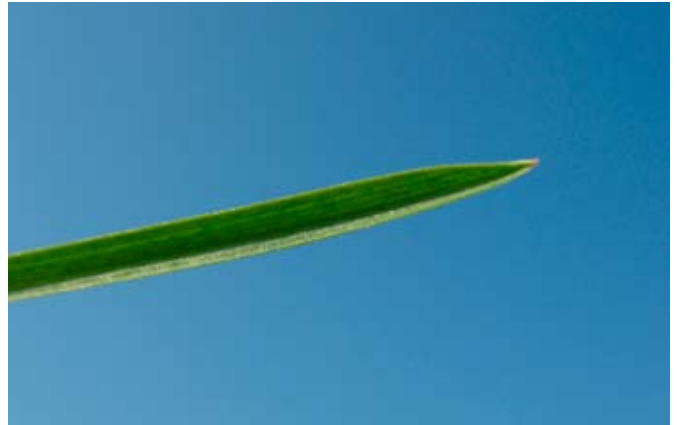
Figure 3. Annual bluegrass ( Poa annua ) leaf blade