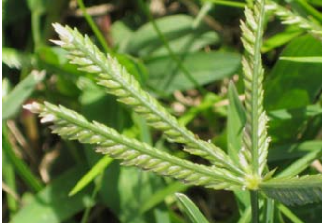
Figure 3. Goosegrass ( Eleusine indica ) closed seed head