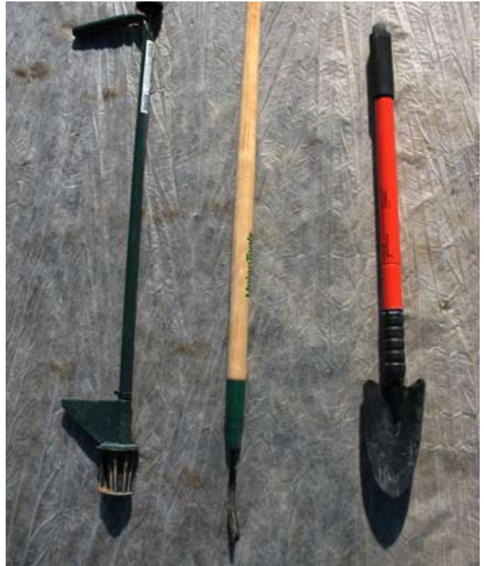
Figure 5. Useful tools for mechanical removal

season than crabgrass makes a sequential application strategy essential. Target the initial application for February to early March in West Tennessee or mid-March to early April in East Tennessee (note that these are the recommended timings for crabgrass control) (Figure 6), and the sequential application 6-8 weeks later. It is important to remember that preemergence herbicides evaluated at the University of Tennessee all provided similar goosegrass control when used according to label recommendations.