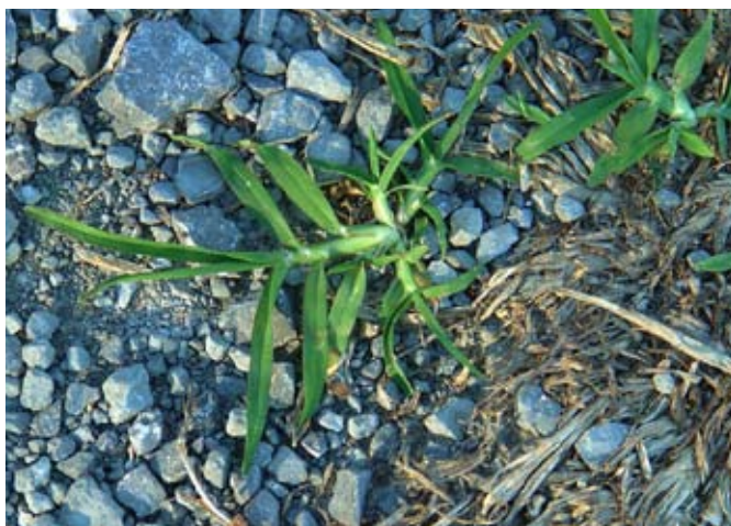
Figure 1. Mature goosegrass ( Eleusine indica ) plant

Goosegrass is a summer annual grassy weed that germinates in late spring and grows throughout the summer. Although its life cycle is similar to that of crabgrass, goosegrass seed germination usually occurs four to six weeks later than crabgrass and is more difficult to tame. Germination of goosegrass seed will generally start sometime in late April in Tennessee and will continue throughout the summer.