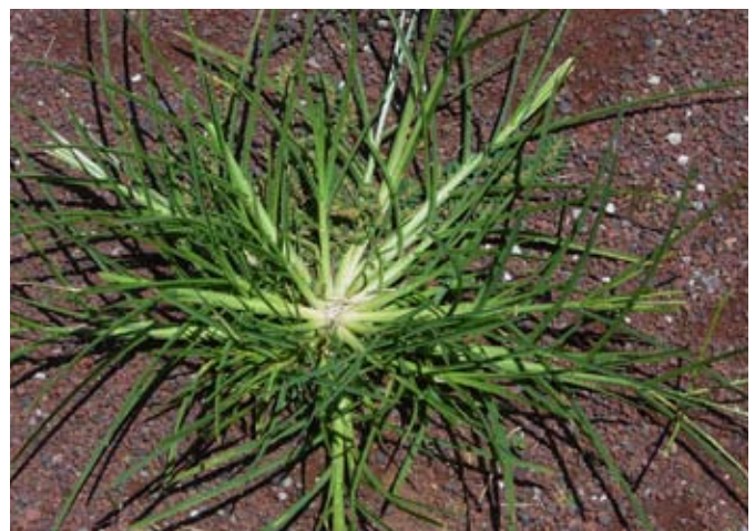
Figure 2. Goosegrass ( Eleusine indica ) seedling