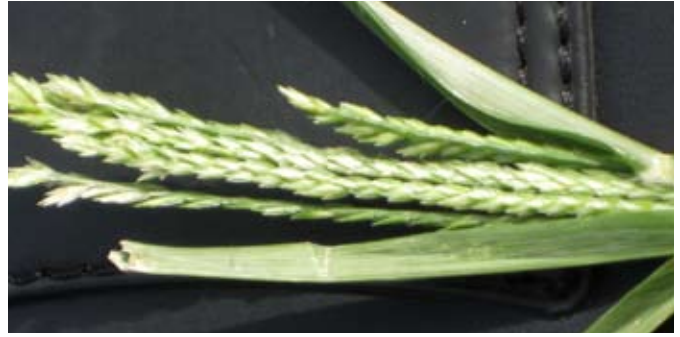
Figure 4. Goosegrass ( Eleusine indica ) opened seed head

Herbicidal Control: Preemergence herbicides provide effective goosegrass control. Several herbicide options for preemergence goosegrass control are listed in Table 1. Many of the materials applied for preemergence crabgrass ( Digitaria spp. ) control will also control goosegrass. Data from the University of Tennessee have shown that sequential applications of preemergence herbicides will provide an increased level of goosegrass control, as well as extend the length of crabgrass control provided by these materials. The fact that goosegrass germinates later in the