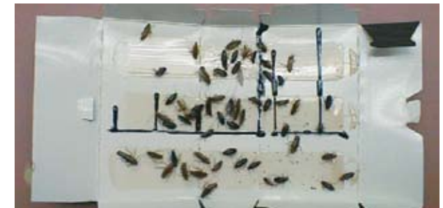
Glue boards or sticky traps are ideal ways to monitor pests.

The mere presence of one insect does not always require the application of a pesticide. The PMP and school staff should decide in advance how many pests are harmless and how many require control.