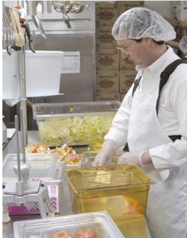
Good sanitation in food preparation areas is key to a successful pest management program.

Examples of pest-management objectives include (1) controlling pests that are found in the facility to prevent interference with learning, (2) eliminating possible injury to students and staff, and (3) preserving the integrity of buildings.