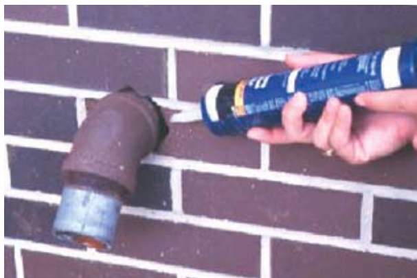
Sealing entry points can prevent pests from getting inside.

Accurate record keeping allows the PMP to evaluate the success of the IPM program. Records also help in forecasting the appearance of seasonal pests to predict future pest outbreaks.