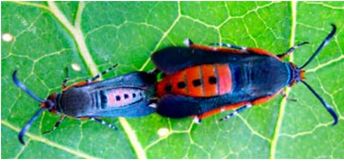
The male and female moths mating. The male is on the left and the female is the larger one on the right.