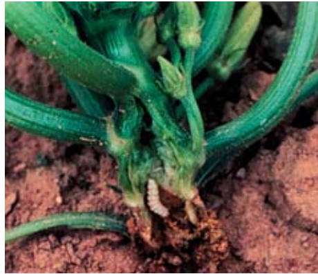
Larva visible in the vine. Frank A. Hale

Squash vine borers, Melittia cucurbitae (Harris) [Order Lepidoptera, Family Sesiidae] use their chewing mouthparts to bore into stems of their host plants. Squash, pumpkin and gourds are commonly attacked. Hubbard squash is preferred over other hosts, while butternut squash is less susceptible than other types of squash. Melons and cucumbers are usually not attacked. The larvae are usually found in the lower 3 feet of the stem. Their continuous feeding girdles stems so that water and nutrients taken up by the roots cannot reach the rest of the vine. This damage causes infested plants to weaken and often die. Injured vines will often decay, appearing wet and shiny. The larva pushes yellow, sawdust-like excrement (frass) out of its expanded entry hole in the stem. The frass, mixed with decaying plant tissue, often oozes from the wounded stem as a wet, curdled, greenish-yellow exudate.