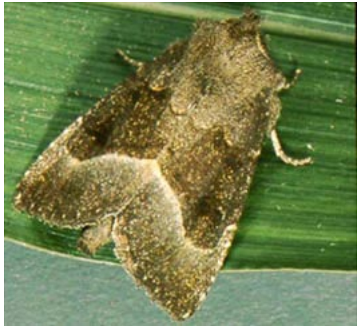
Figure 2. Adult Moth

A thorough cleanup of weeds in the field is essential to prevent the larvae from migrating to corn. As soon as the grassy weeds are killed in a field, the larvae move from them to a larger-stemmed plant, such as corn. One method of control is to burn weeds with an herbicide and treat with an insecticide as the larvae move to the corn. Careful timing is essential to achieve control of the borers before they bore into the corn plants. Once the insects are inside the corn plant, they are difficult to control.