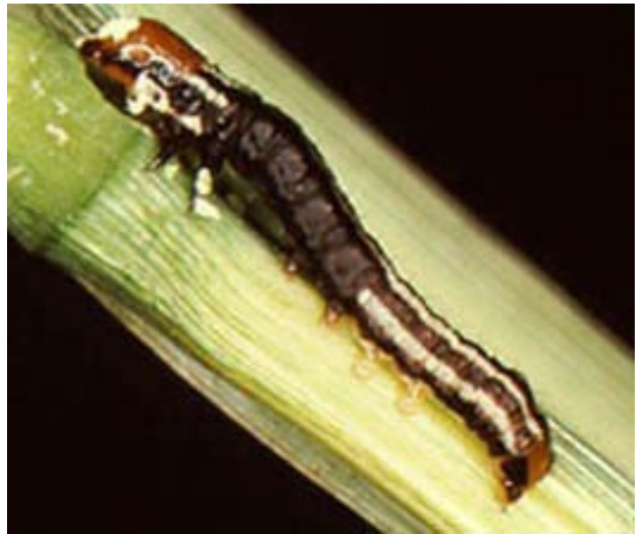
Figure 1. The Common Stalk Borer

Adult female moths deposit their eggs on grasses in the fall, and the eggs overwinter on the grasses. In the spring, the eggs hatch and bore into the stems of the grass. The larva then burrows up and down the stem, feeding on the