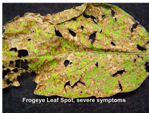
Frogeye Leaf Spot, severe symptoms

Moisture is the number one factor needed for disease development, but along with moisture, continuous soybeans, susceptible varieties and low soil fertility (especially low potassium and low pH) also increase the chances for yield loss from disease. Producers should consider spraying fields that are subject to these conditions. However, if there is little hope for a good yield (at least 30 + bushels per acre) spraying a fungicide might not be as economical as one that has a high yield potential.