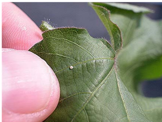
Pictured – Bollworm egg on leaf

Cotton. Generally all crops look great, but it is concerning that some cotton fields are just now starting to bloom and the cool weather is not helping us catch up. This cool and wet weather favors plant bugs but it has been a quiet week. Calls from several areas indicate a lull in plant bug pressure, but I am seeing a steady increase of immature plant bugs in many fields if they were not recently treated. On the upside, stink bug populations are lower than normal, this is not good weather if you are a spider mite , and the bollworm flight has not yet kicked off in earnest. I still expect an above average bollworm flight starting this coming week and really picking up the week after. The cooler weather may slow it down a bit.