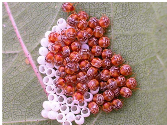
Pictured – Hatching green stink bug egg mass

Soybean. As in cotton, stink bug populations are generally lagging behind normal but so are many soybean fields. Corn earworm (a.k.a. bollworm) can be a serious pest of soybean beginning at R2 and continuing through flowering. I've had no reports of problems but stay alert for corn earworm, especially in wide-row spacings and later maturing fields. Corn earworms tend to be more common in open canopies. The rainfall in the past two weeks will close the canopy of many fields and this should help. Use a threshold of 36 corn earworm larvae per 100 sweeps. Reminder – R3 thru R6 is crunch time for insect control so concentrate your scouting efforts during this window. Check fields every 7-10 days.